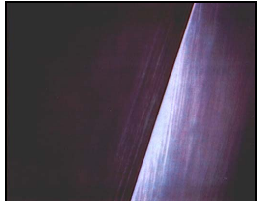
"Ultra-Finish" on carbide is 0-2 micro inches